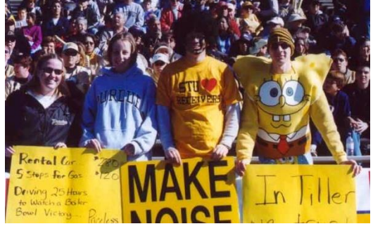
Purdue students cheer on the Purdue Boilermaker football team!

If students would rather compete than exercise, the Purdue Recreational Sports Center sponsors several club sports teams and organizes athletic tournaments every semester. The website for the various club sports at Purdue is: <a href="https://www.purdue.edu/recwell/programs/clubSports">www.purdue.edu/recwell/programs/clubSports</a>.