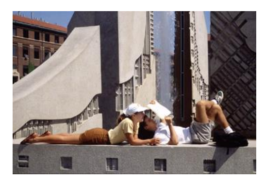
Students relax while studying at the Purdue Mall