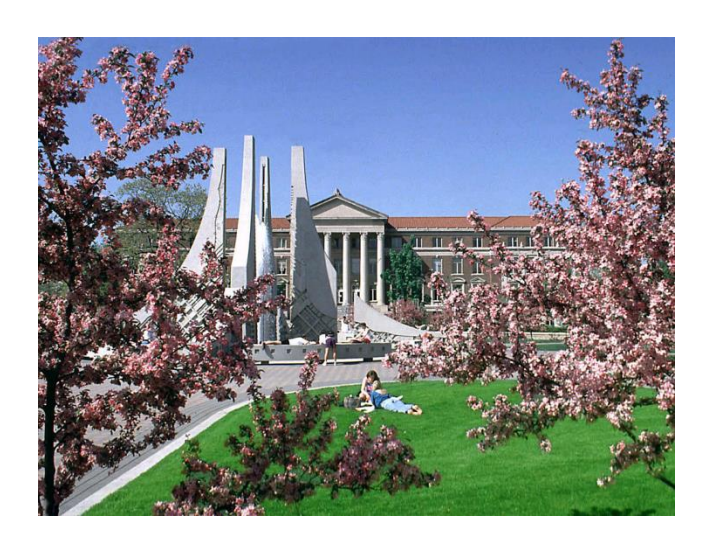
Spring at Purdue University