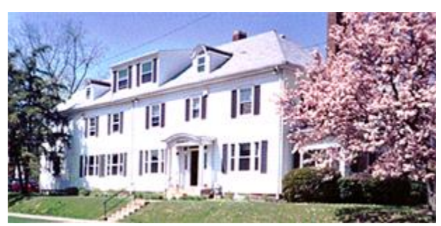
The Glenwood Cooperative House for women.

Cooperative or Co-op housing is the least expensive housing system at Purdue. Each house has between 24 and 53 members who share responsibilities such as cleaning and preparing meals to maintain a comfortable living environment. Members of the cooperative houses have between three to five hours of house duties a week. Vacancies are occasionally available, and exchange students can apply as boarders to any of the cooperative housing units. For more information and contact information, the cooperative housing website is: www.purduecooperatives.org.