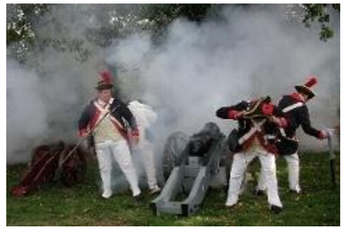
The Feast of the Hunters' Moon is a recreation of the annual fall gathering of the French and Native Americans which took place at Fort Ouiatenon, a fur-trading outpost in the mid - 1700s.

There are also special events and festivals that take place at Purdue and in the Greater Lafayette area every semester. The fall semester also includes fun and interesting events such as Global Fest (near campus at the Morton Community Center) during early September's Labor Day weekend, and the Purdue Homecoming Celebration and the Feast of the Hunter's Moon at Fort Ouiatenon in October. During the spring, Purdue's Spring Fest and the International Food Bazaar, both in April, are highly anticipated events