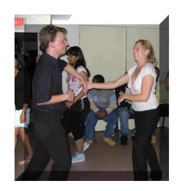
The International Center (IC) hosts a variety of cultural events and activities

The International Center (IC) in the Purdue campus also organizes several social events throughout the semester. For a list of activities, visit the IC website at: <a href="www.intlctr.org">www.intlctr.org</a>. More information on the arts and music scene in the Lafayette area can be found at: <a href="www.lafayette-online.com/arts">www.lafayette-online.com/arts</a>.