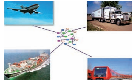
Planning of logistics processes