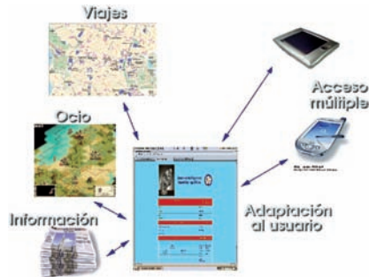
Building of automatic customization tools