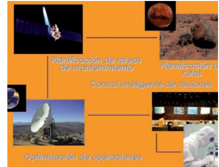
Planning of Space Missions