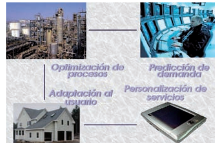
Prediction and planning of control sequences in industrial processes