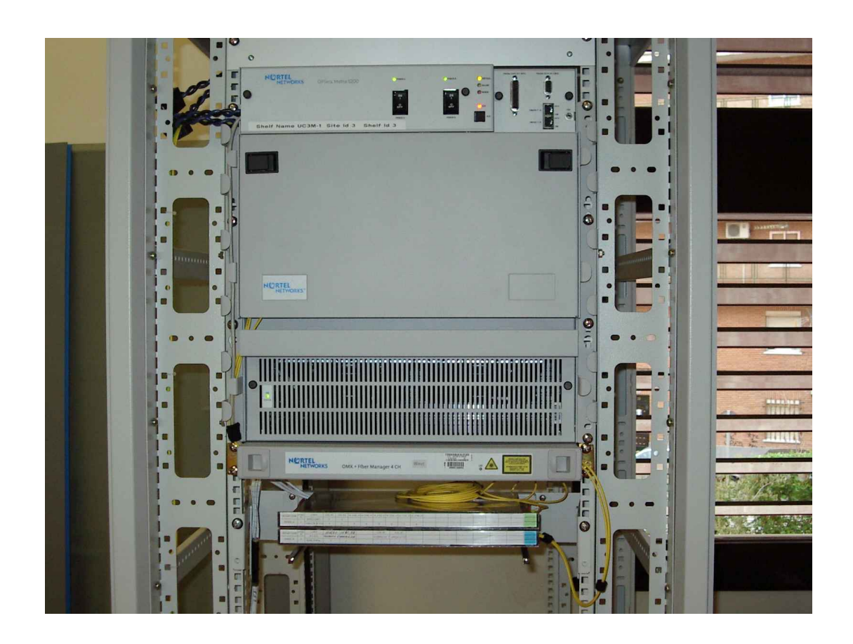
High performance communications infrastructure of the Telematic Engineering department