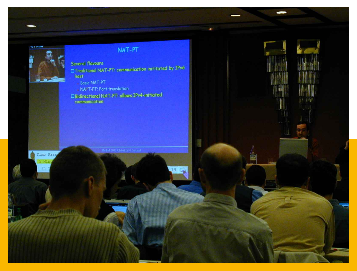
Telematic Engineering department researchers participating in the IPv6 Forum (Madrid)

We have established a large number of successful collaborations with institutions and companies, both Spanish and foreign, through R&D projects, consultancies and service provision. We count among our main partners the Ministry of Science and Technology (Ministerio de Ciencia y Tecnología), the Madrid regional government (Comunidad de Madrid), Telefónica, Agencia EFE, Ericsson, Portugal Telecom, Bankinter, Deutsche Telecom, Philips Research Eindhoven, ABB Norway y Nokia Finland. We have established mutually-beneficial long-term strategic alliances with Nortel, Nokia and Telefónica. We are acting as project leader in several projects of the European programs IST, @LIS, MEDEA+ and ITEA.