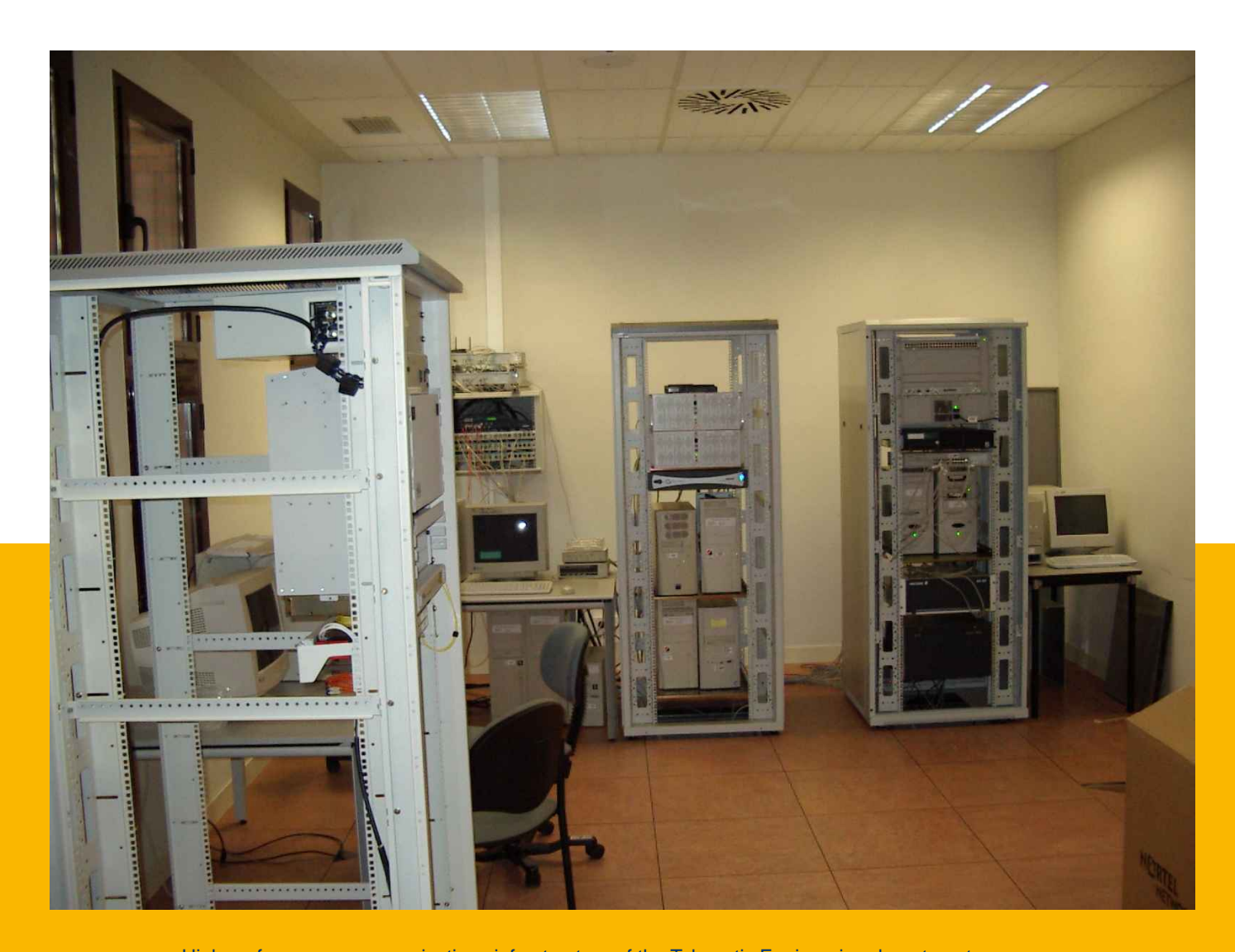
High performance communications infrastructure of the Telematic Engineering department