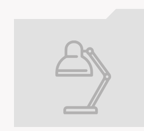
SCHOLARSHIPS: UC3M GRANTS AIMED AT STUDENTS WITH THE BEST ACADEMIC RECORDS.