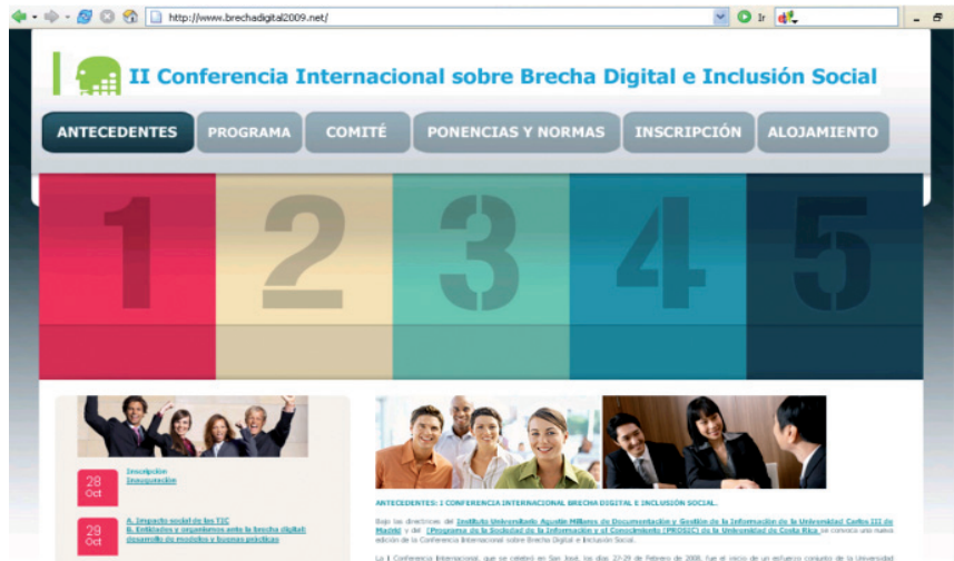
International Conference on the Digital Divide. http://www.brechadigital2009.net/