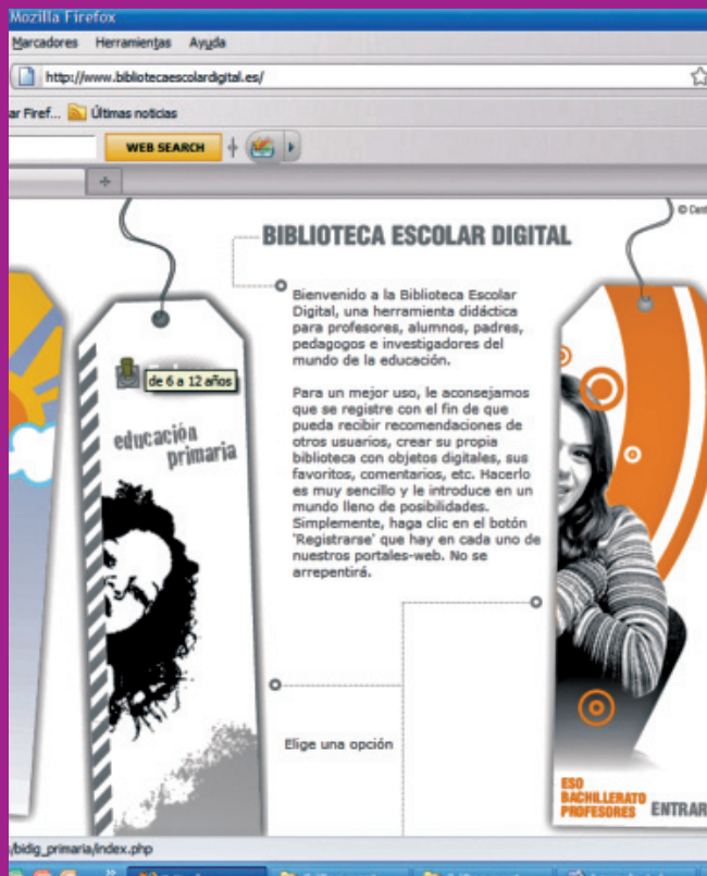
Digital Educational Library of the International Centre for Advanced Technologies of the Germán Sánchez Ruipérez Foundation. Available at: http://www.bibliotecaescolardigital.es/