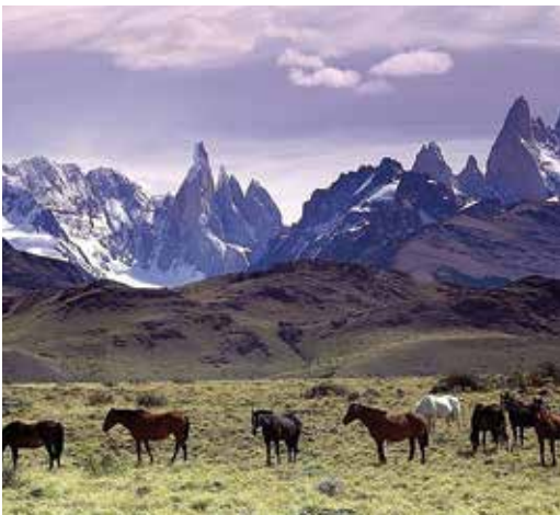
Andes mountain range, Mendoza.