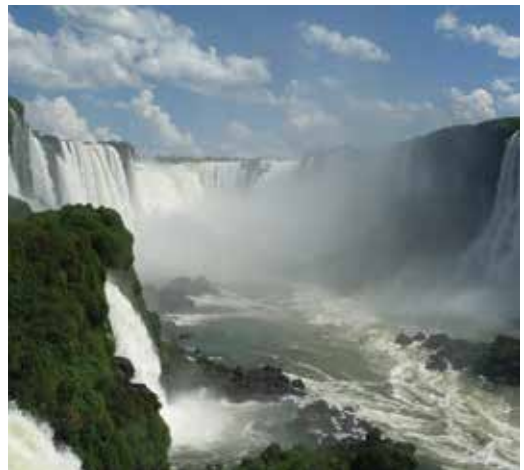
Iguazú Falls, Misiones.

Argentina's geography and climate are widely varied, providing many unique travel opportunities. The northern part of the country is subtropical and home to the breathtaking Iguazú Falls. To the west is the Andes mountain range, where great skiing and hiking are only a two-hour flight from Buenos Aires. Further south, the Perito Moreno Glacier, notable because it is still advancing, and Ushuaia, the world's southernmost city, are spectacular destinations.