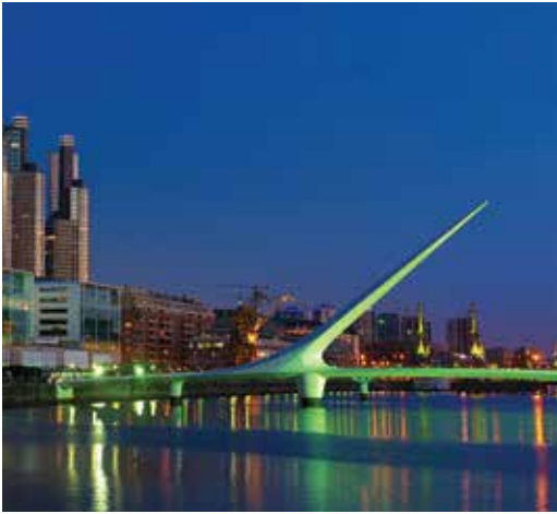
Women's Bridge, Puerto Madero, Buenos Aires.