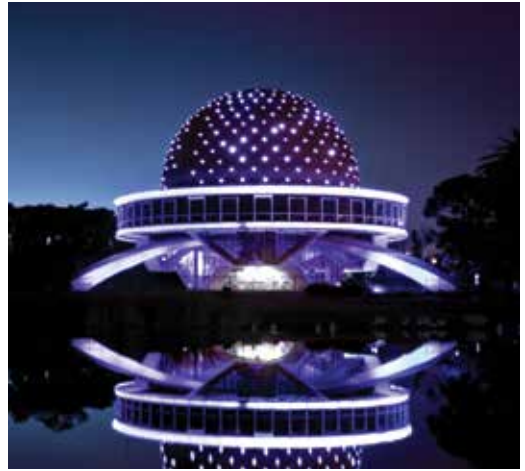
Planetarium, Palermo, Buenos Aires.