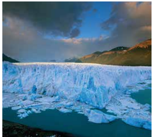
Perito Moreno Glacier, Santa Cruz.