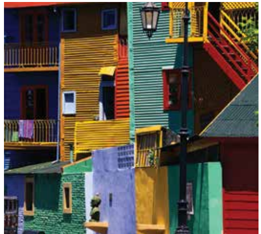
Caminito Street, La Boca, Buenos Aires.