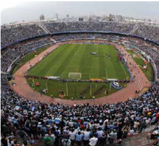
River Plate Stadium, Belgrano, Buenos Aires.