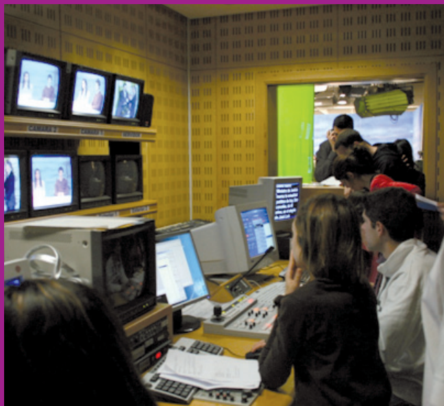
School of Humanities, Communication, Library Sciences and Documentation.

televisión–cine: memoria, representación e industria