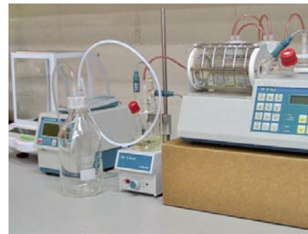
Karl-Fischer equipment for moisture-content titration in paper insulation for power Equipment for capacitance and tg measurements.

· Measurement and characterization of spatial charge injected, by electroacoustic pulse (EAP).