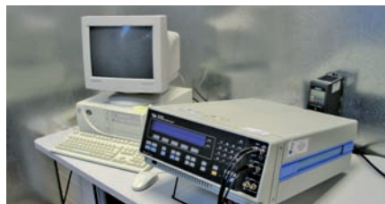
Equipment for characterising the dielectric response of insulating materials in the control of frequency. Band width/range 0,1 uHz at 30 MHz