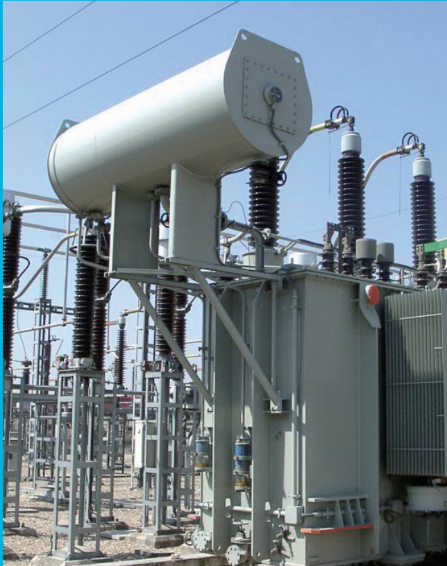
Development of systems for real-time monitoring and diagnosis of insulating status in distribution transformers

The Group of Diagnosis of Electrical Machines and Insulating Materials (DIAMAT), led by Dr. Javier Sanz Feito, is formed by a team of twelve experts in the development of novel techniques for the monitoring and diagnosis of electrical machines, including power transformers, the analysis of the behavior of insulating materials in electrical devices and machines and the performance of high-voltage tests and measurements and analysis of dielectric response (in the frequency domain).