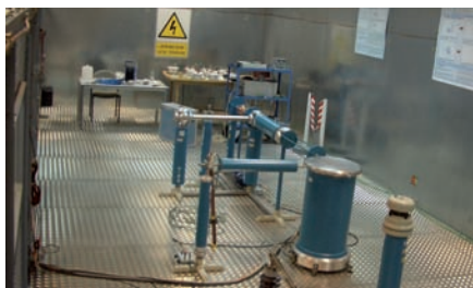
View of the High Voltage Laboratory