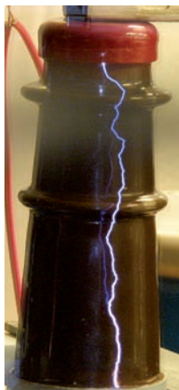
Applied voltage tests on an outdoor MV insulator

The main clients of the group include UNIÓN FENOSA DISTRIBUCIÓN, S.A., DIAGNOSTIQA S.A., SANTOS Maquinaria Eléctrica S.L. or CEIS S.L., with which it maintains close and steady relationships.