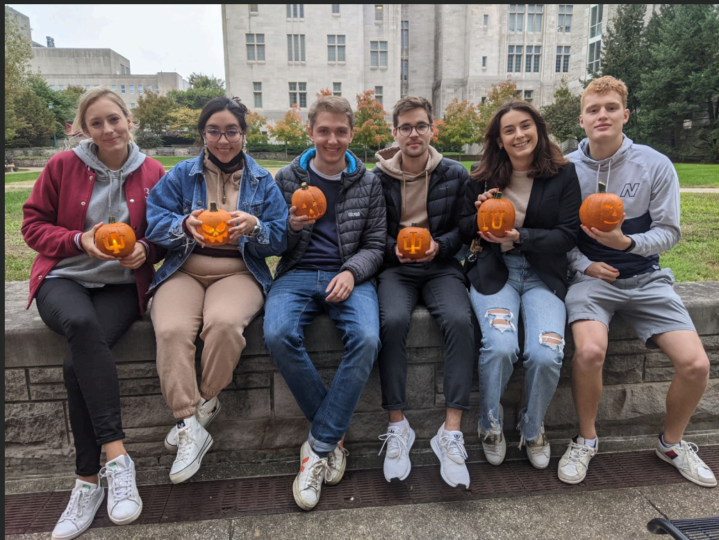
Halloween Pumpkin Carving