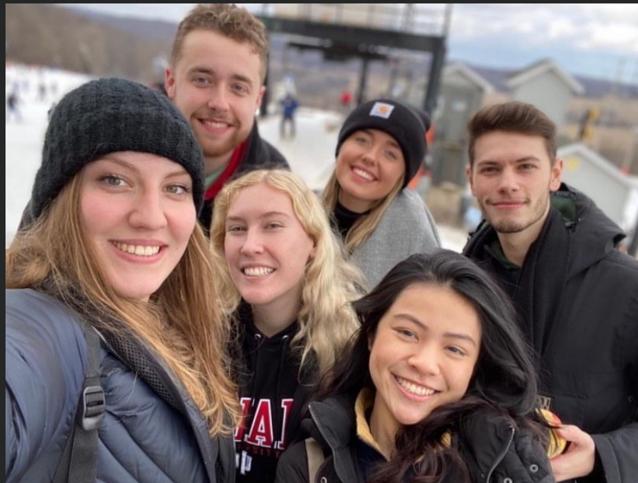
Kelley Habitat Build, OIS Ski Trip